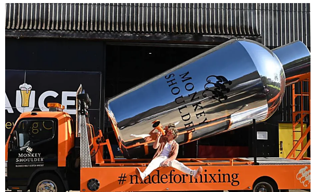
Giant cocktail shaker visiting Illawarra Brewing and North Gong Hotel