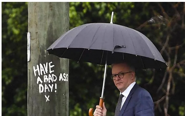
Day 31 of the federal election campaign